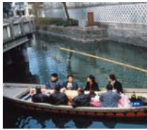
Kotatsu-bune down the canal