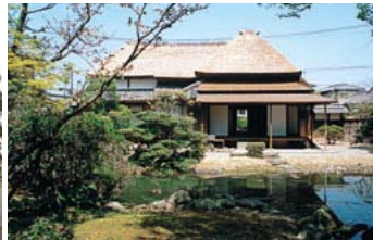
Former Residence of the Toshima family

Yanagawa was established as a castle town governed by the lord of a castle since 700 years ago in the Muromachi Period (1333-1568). Then it was ruled by the Tachibana family during the Edo Period (1600-1868).