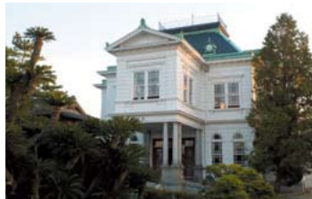
Ohana Seiyokan (Western-style building)

Looking for vestiges of the castle town boasting a long history