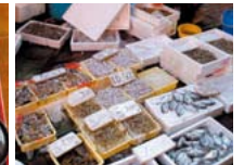
Cuisine made of fish and shellfish from the Sea of Ariake