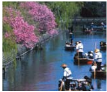
Cherry blossoms and the canal

Enjoy the seasonal landscape from the canal.