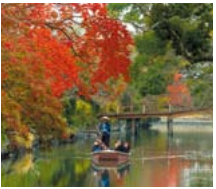
Kawakudari in autumn