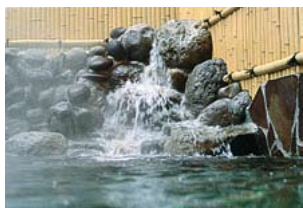
Mizu no Sato "Haenkaze"

Kyushu is renowned as a hot spring paradise. Yanagawa is not an exception. A hot spring found in 1965 contains sodium bicarbonate and salt in its colorless and transparent water, which beautifies your skin and is effective for skin diseases and neuralgia.