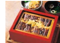
Unagi no Seiro-mushi

Gifts from the fertile sea and traditional skills