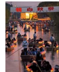
Water Parade at Hakushu Festival

Seasonal events that gives various colors to Yanagawa