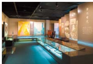
Yanagawa Municipal Folk Museum

A footprint of the great poet the town of water produced